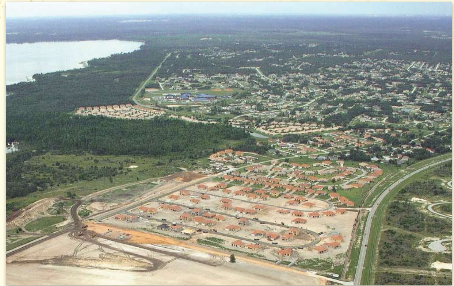
Aerial view of construction progress at Tuscany Preserve at Lake Marion | September 10, 2007

There is nothing like the sounds of people busy at work, readying a community to welcome its newest residents. Take one look around at Tuscany Preserve today and you'll realize how far we've come in so little time. We share your sense of excitement and want to keep you updated on our growth. We have been working very hard to ensure that your new home and the entire community will adhere to the highest standards of quality and value. To that end we are happy to report that Phase 1 is complete and many homes in Phase 2 are in the completion stages. We are moving along rapidly with the development of the Phase 3 townhomes and villas, clubhouse and amenities.